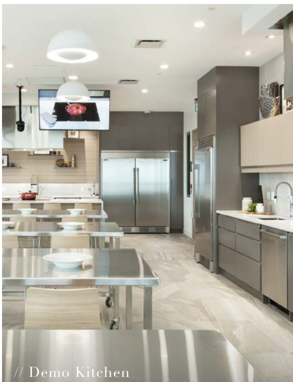
// Demo Kitchen